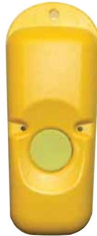
Man Down Pendant