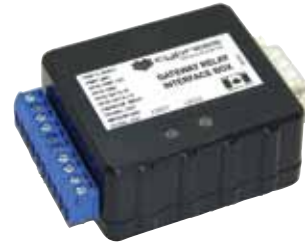
Gateway Interface Box