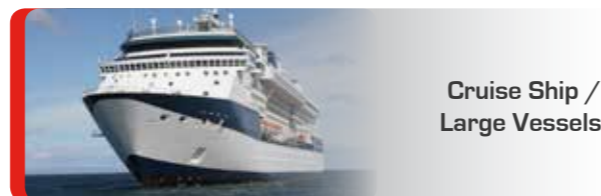
Cruise Ship / Large Vessels