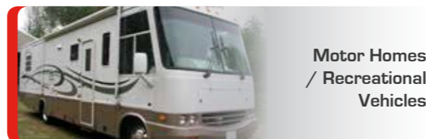
Motor Homes / Recreational Vehicles